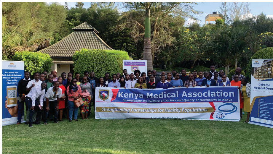
Photo 3. Event speakers, organizers, and attendees at the 2022 KMA YDN Conference.