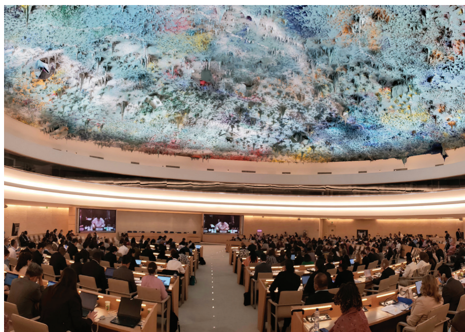
Photo 1. The Human Rights and Alliance of Civilizations Room where many WHA discussions and negotiations occurred.