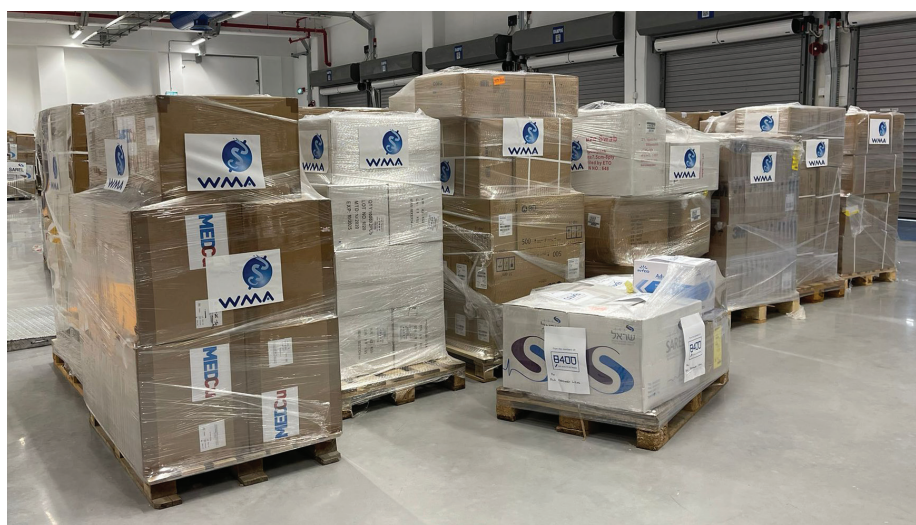
Photo 2. Materials ready for delivery to Ukraine.