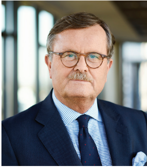
Frank Ulrich Montgomery

There are many challenges in the delivery of medical services worldwide. One specific problem that has been underestimated in its importance in the health setting has been recently discussed: racism in medicine. With increased mobility and transparency of the global medical workforce and general societies, it becomes more and more apparent about how unjust and improper all forms of racism are. A medical profession that is representative of the general population has a crucial role in addressing health disparities as a result of racism.