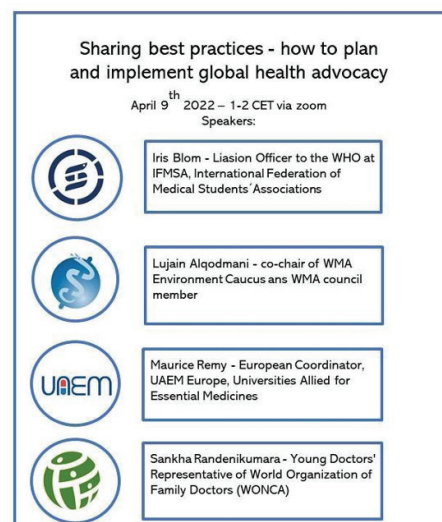
Figure 1. Promotional poster for the Sharing Best Practices webinar, held on 9 April 2022.

Being a health advocate is recognized among the core competencies of physicians and other health care providers [2]. However, this is often not reflected in educational strategies to prepare students, postgraduates, and early career professionals. In order to teach advocacy skills, such strategies that move away from classical lectures and seminars and include more interactive formats (e.g. simulations) and hands-on experiences (e.g. project placements) should be promoted [3].