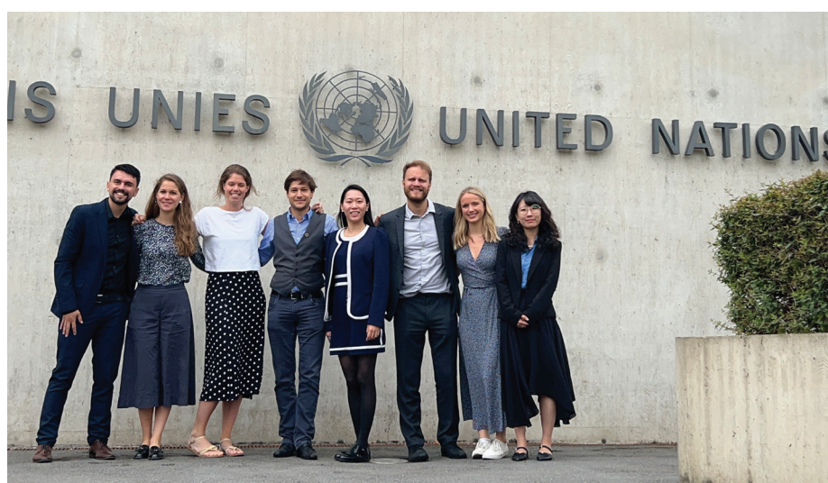
Photo 2. JDN Delegation in front of the Palais des Nations.

From 25 April to 31 May 2022, the Pre-WHA Organizing Committee posted key social media messages on