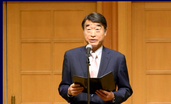
Minister of Health, Labour and Welfare Nemoto