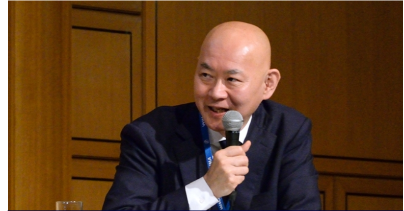
Dr. Masamine Jimba

Controlling health threats can be a contributor to achieving UHC, and UHC can be a key to overcoming such devastating health threats.