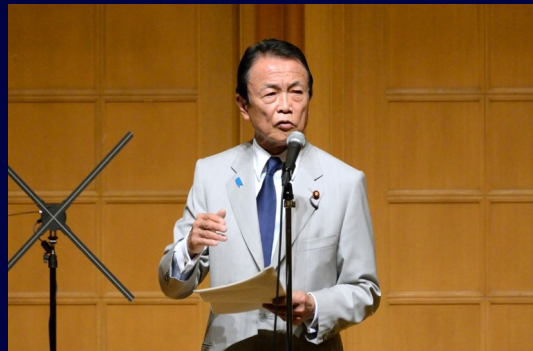
Minister of Finance Aso