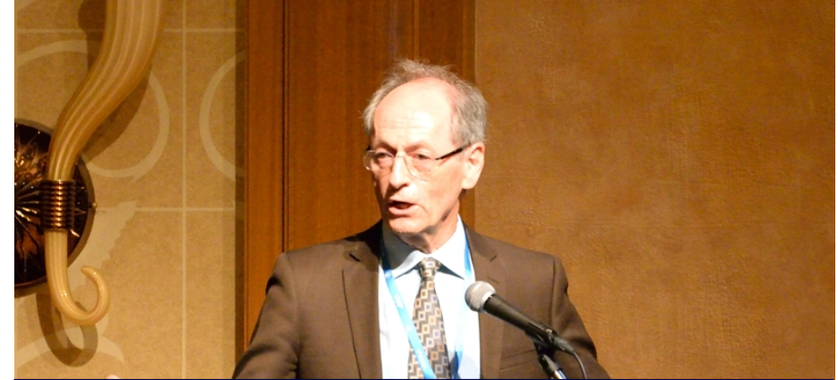
Sir Michael Marmot: Health Inequities and SDH

If we want to achieve not just healthcare coverage, but better health for our populations, we need to be taking action on the social determinants of health.