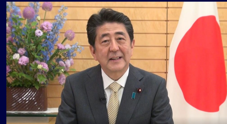
Prime Minister Abe