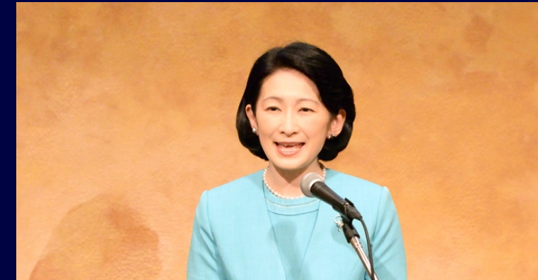
Her Imperial Highness Crown Princess Akishino

June 13 th & 14 th , 2019, Hilton Tokyo Odaiba, Tokyo