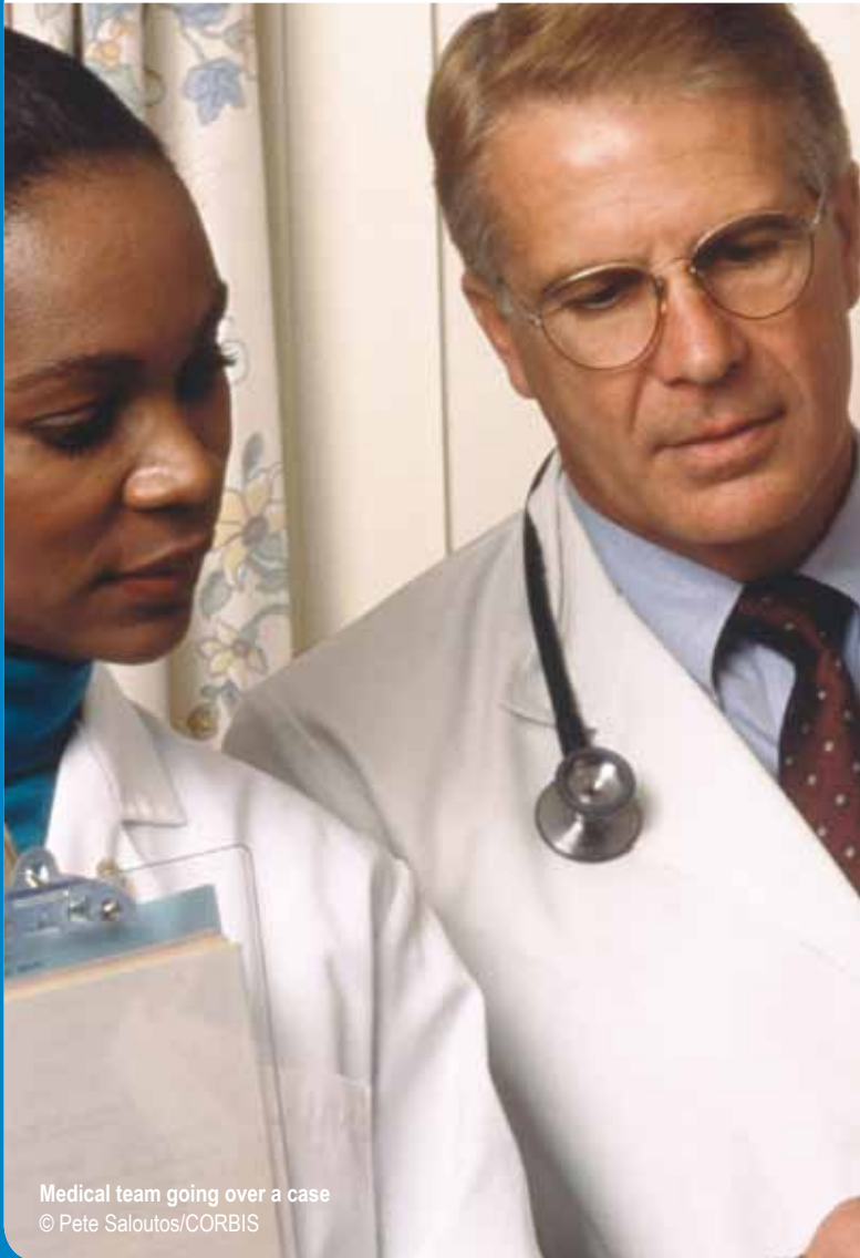
Medical team going over a case